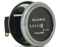
Stainless Bezel Available