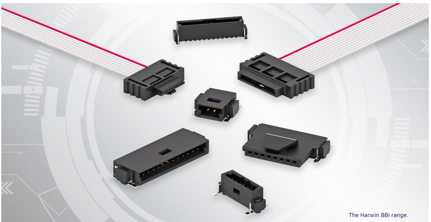
The Harwin BBI range.

For applications that do not suit a mixed connector layout, the Kontrol series offers a range of 1.27mm pitch board-to-board connectors that combines high-reliability with current ratings of up to 1.2 Amps per contact. Featuring a robust latch for high-vibration environments, their compact size and ease of integration make them ideal for confined spaces, and their blind-mating capability allows for easy assembly applications. Together, Flecto and Kontrol deliver the durability, safety, and efficiency that the rapidly evolving EV market demands.